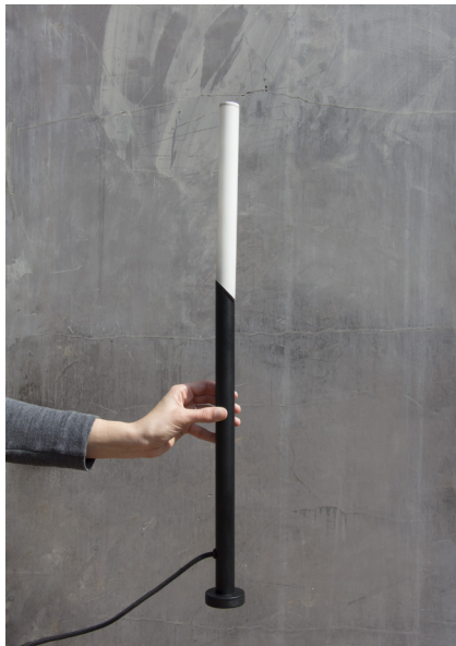
Materials Metal and plastic

Minimal work lamp and lighted on with a gentle turn. The base is secured to the table by a suction cup which allows the lamp to be more stable